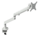
Single monitor arm