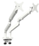
Dual monitor arm