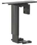
Universal CPU holder