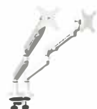
Dual monitor arm