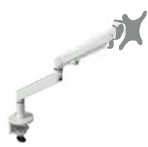
Single monitor arm